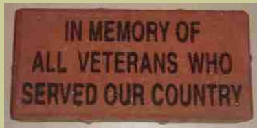
Example of a 4"x 8" inscribed brick.

Help pave the pathway to the War Memorial Restoration.